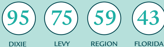
NCF COUNTIES WITH HIGHEST RATES